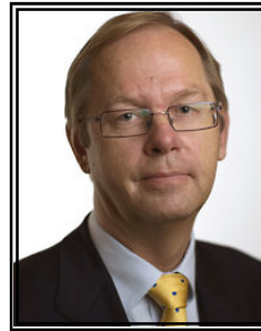
Sten Arne Rosnes, Consul General Consulate General of Norway in San Francisco