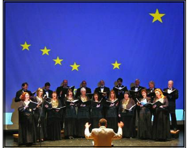
Russian American Colony Singers

Arctic Ambitions II Conference was sponsored by: