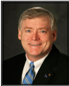
The Honorable Mead Treadwell, Lieutenant Governor State of Alaska