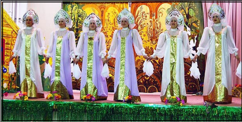
Sudarushka Russian Folk Dance Ensemble

The Russian American Colony Singers is based in South Central Alaska, primarily Anchorage. For about ten years, the choral group has performed with a unique emphasis on Russian music in various genres.